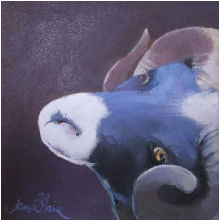
"Shetland Tup" Oil on canvas 200mm x 200mm