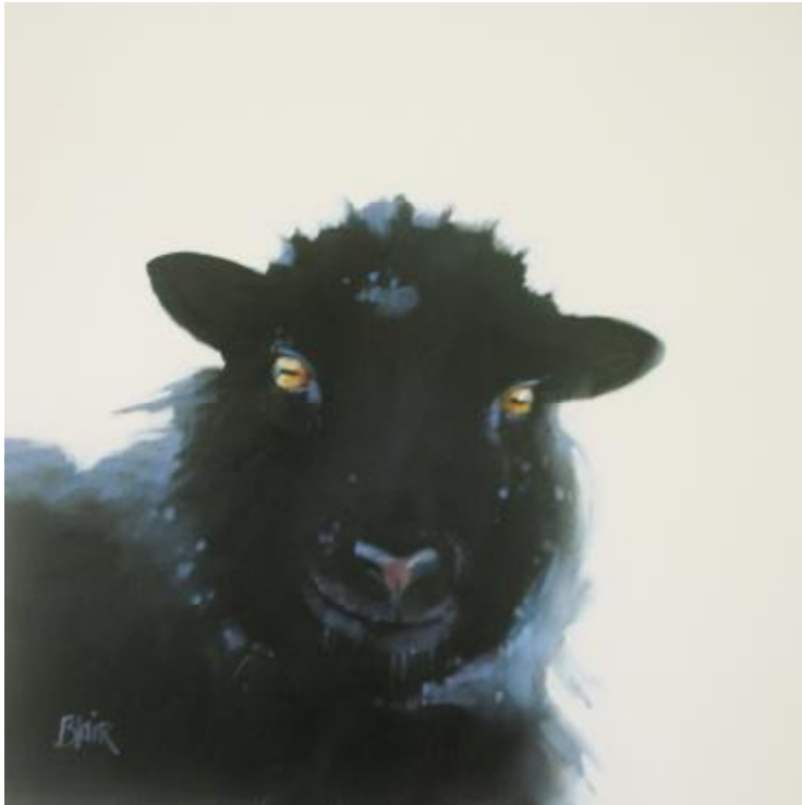
"Shetland in the Snow" Oil on canvas 600mm x 600mm