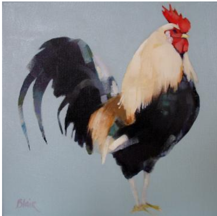
"Cock II" Oil on canvas 300mm x 300mm