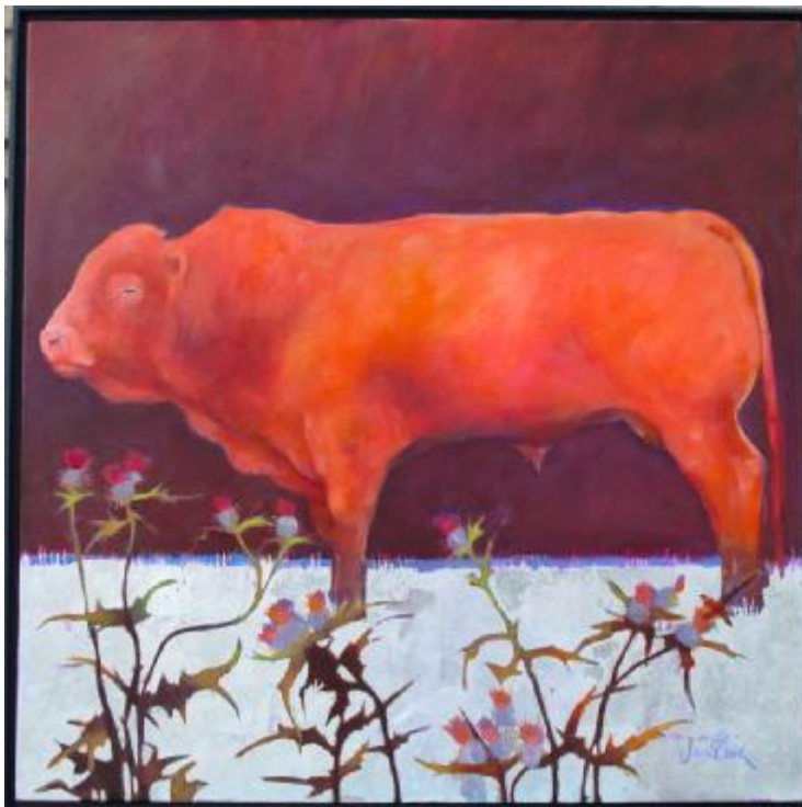
“Charlie in the Thistles” Oil/ gold leaf on canvas 1000mm x 1000mm