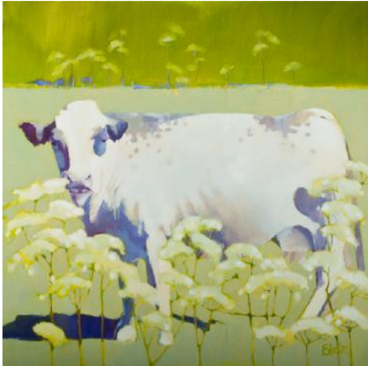
"Cow Parsley" Oil on canvas 1000mm x 1000mm