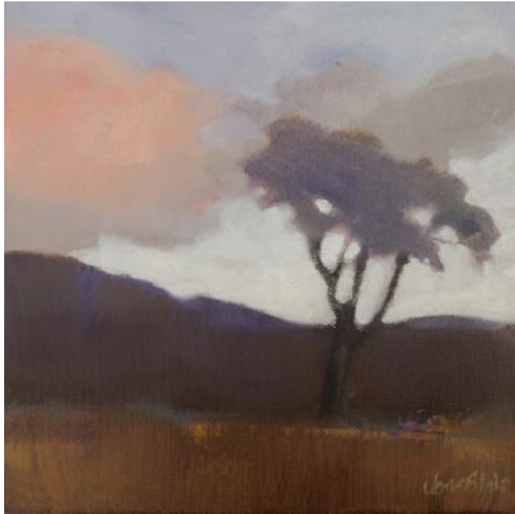
“Pink Cloud near Dervaig” Oil on canvas 200mm x 200mm