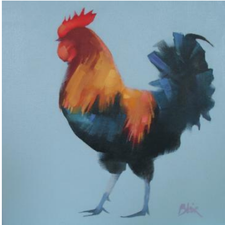
"Cock I" Oil on canvas 300mm x 300mm