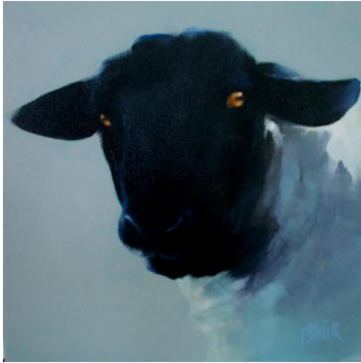
"Suffolk" Oil on canvas 300mm x 300mm