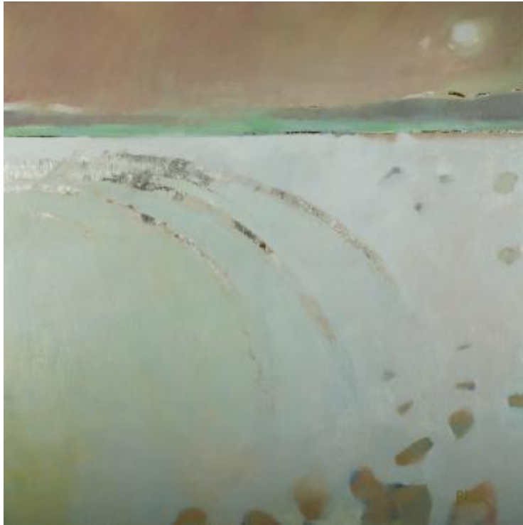
"White Beach, Vatersay" Oil on canvas 1000mm x 1000mm