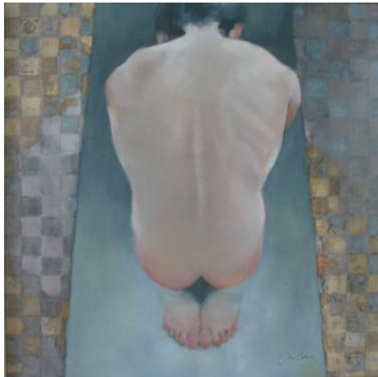
“Boy in Bath” Oil/ gold leaf on canvas 500mm x 500mm