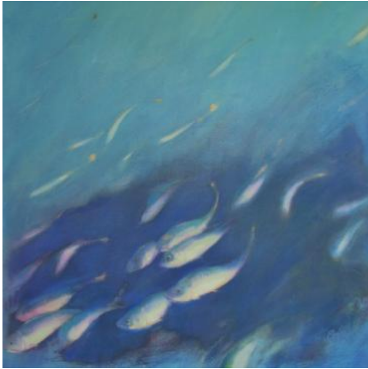
"Mackerel Shoal" Oil on canvas 1000mm x 1000mm