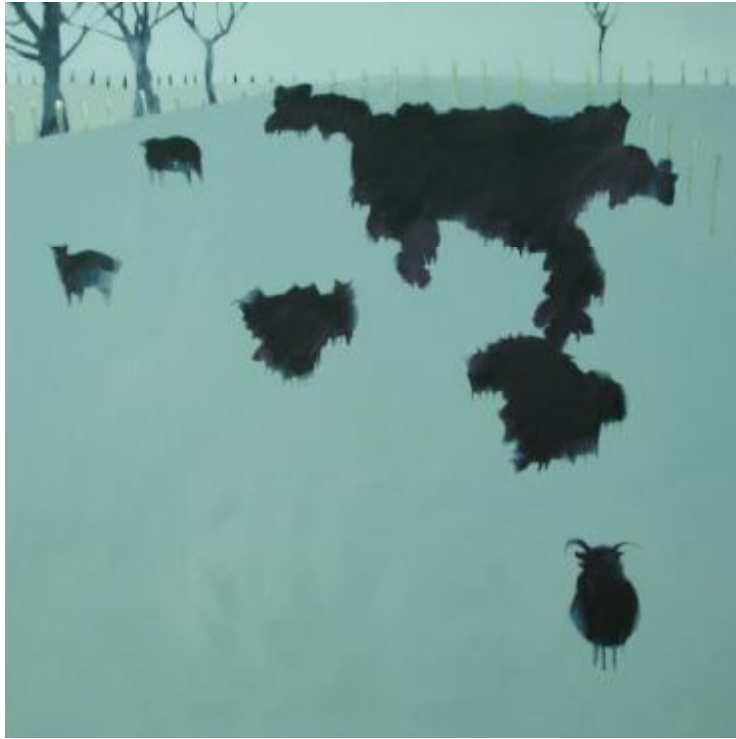
“Highland Sheep in Snow” Oil on canvas 1000mm x 1000mm