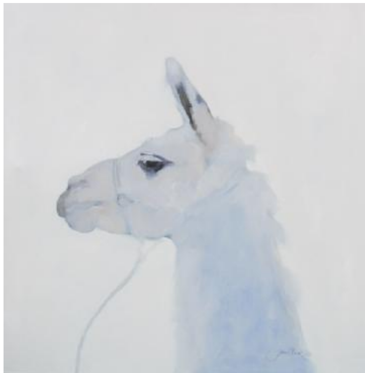
“Jasper” Oil on canvas 800mm x 800mm