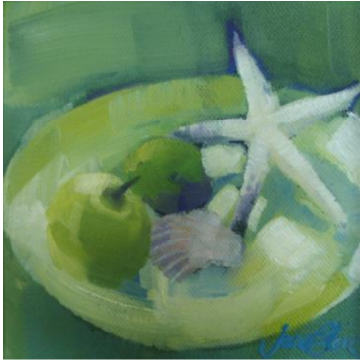
"Starfish Apple" Oil on canvas 150mm x 150mm