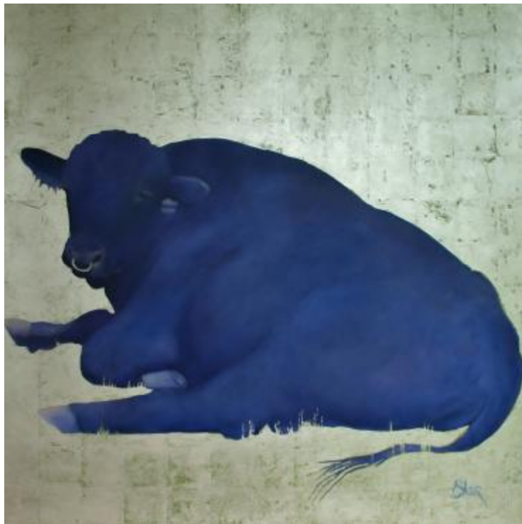
“Angus in Frosty Field” Oil/ gold leaf on canvas 1000mm x 1000mm