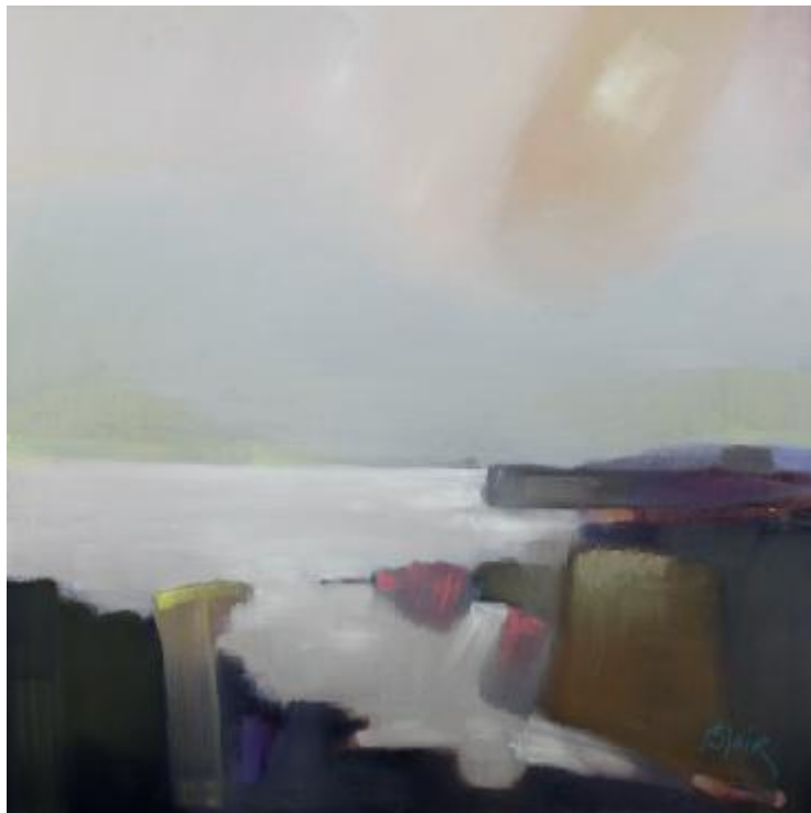
"Mist Clearing by Afternoon, Mull" Oil on canvas 800mm x 800mm