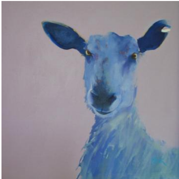
"Blue Face" Oil on canvas 600mm x 600mm