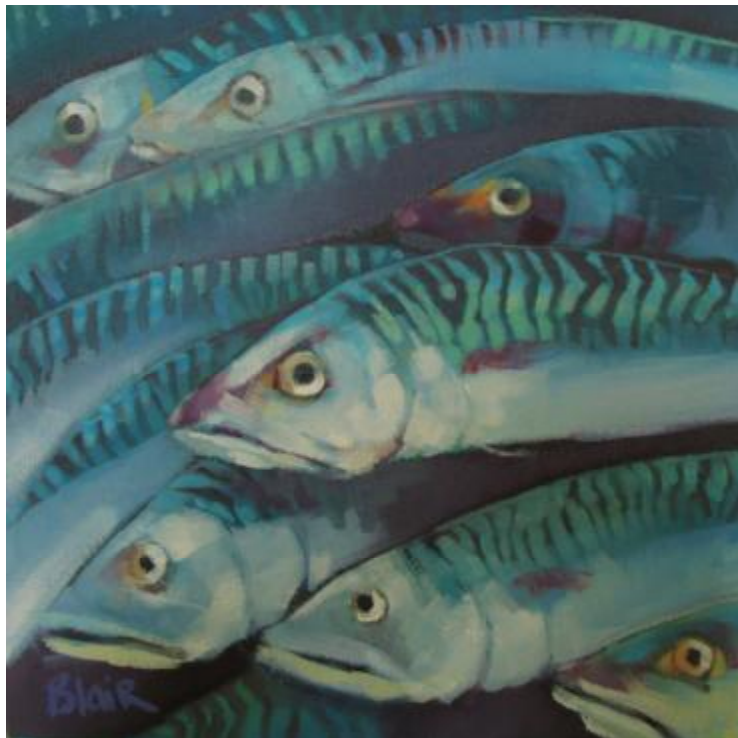
"Mackerel" Oil on canvas 300mm x 300mm