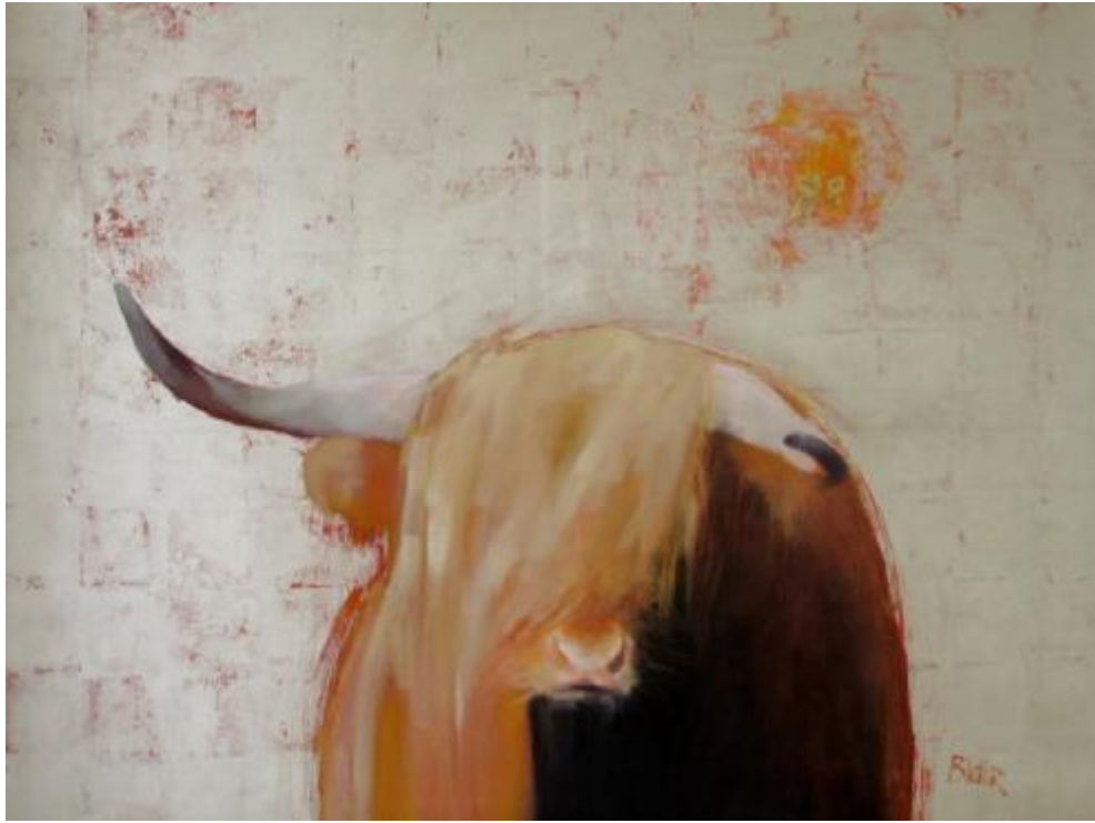
“Highland in Autumn Sun” Oil/ gold leaf on canvas 760mm x 1020mm