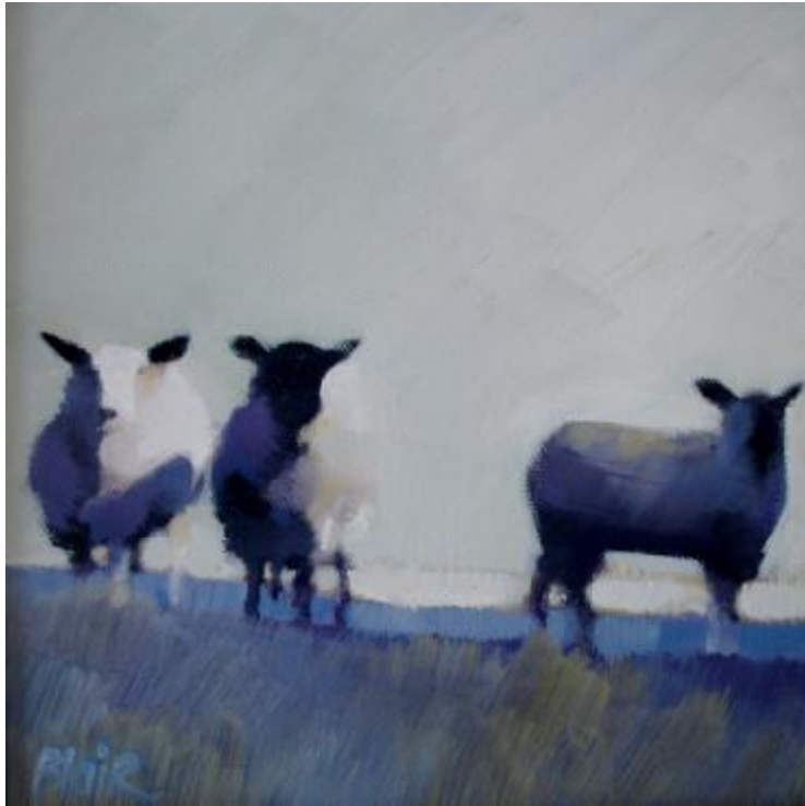
"Early Morning Sunshine" Oil on canvas 200mm x 200mm