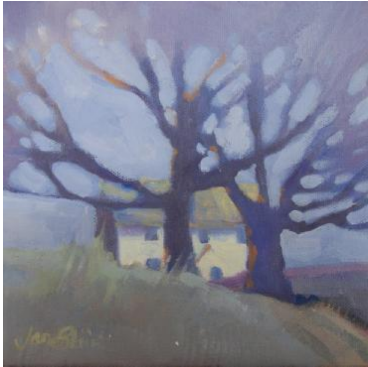
“House near Treshnish” Oil on canvas 200mm x 200mm