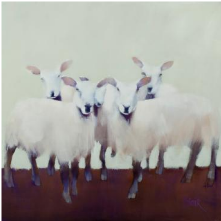
"Misty Blue Faces" Oil on canvas 800mm x 800mm