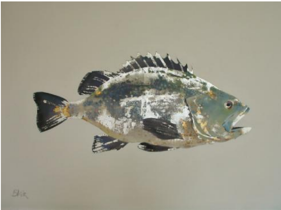
"Big Fish" Oil/ gold leaf on canvas 760mm x 1020mm