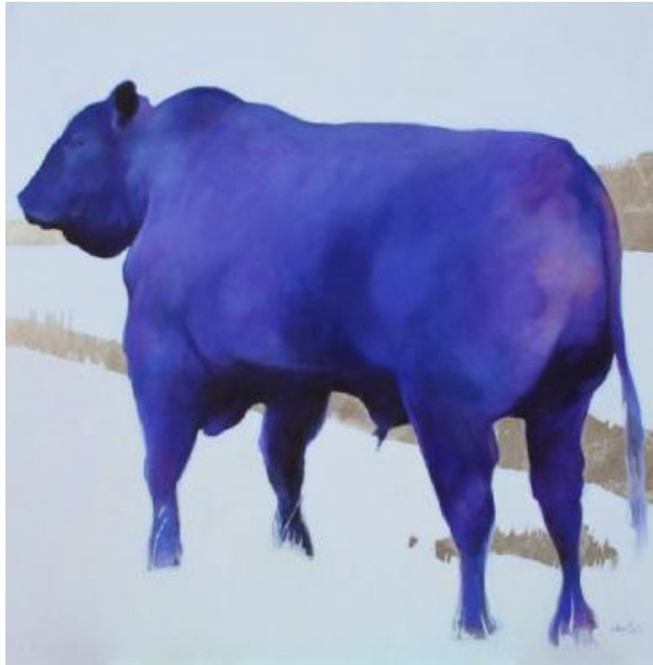
“Blue Bull” Oil/ gold leaf on canvas 1000mm x 1000mm