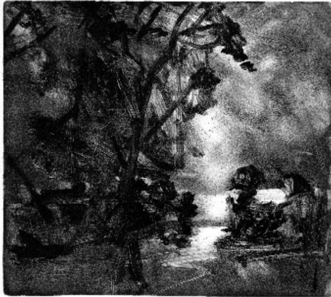
"Alders, Approaching Darkness" Monotype Print 300mm x 260mm