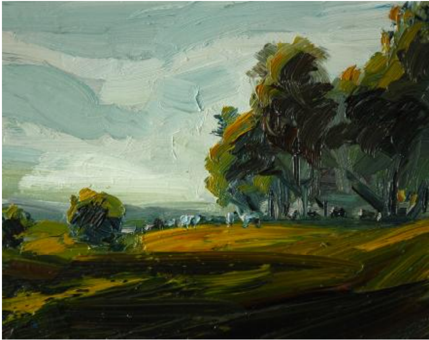
“Cool Evening Light” Oil on Canvas 300mm x 240mm