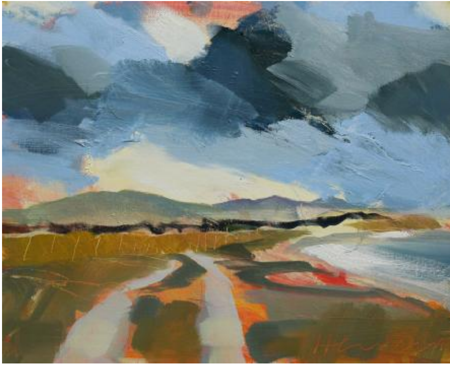
"Fresh Atlantic Breeze" Oil on Board 300mm x 240mm