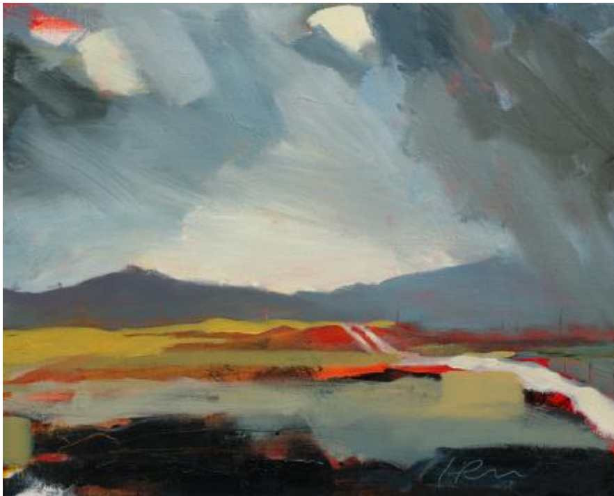
"Rain on the Wind" Oil on Board 300mm x 240mm