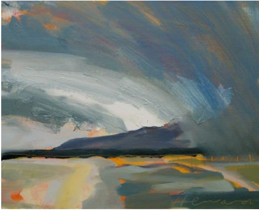
"Approaching Shower" Oil on Board 300mm x 240mm