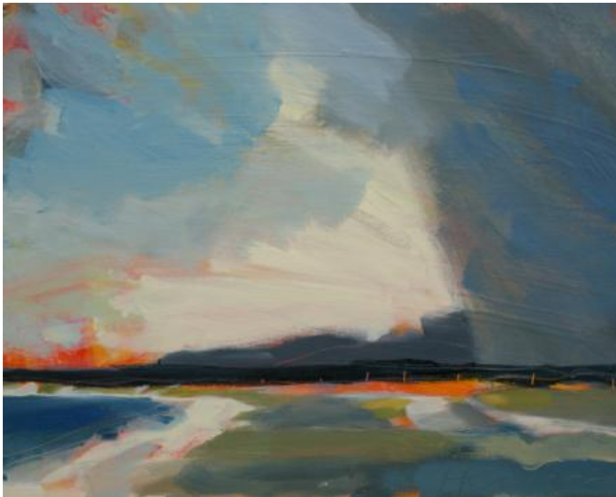
“Rain on the Way” Oil on Board 300mm x 240mm