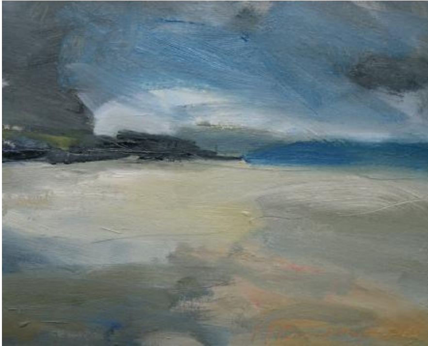
“Low Tide, Wind Picking Up” Oil on Board 300mm x 240mm