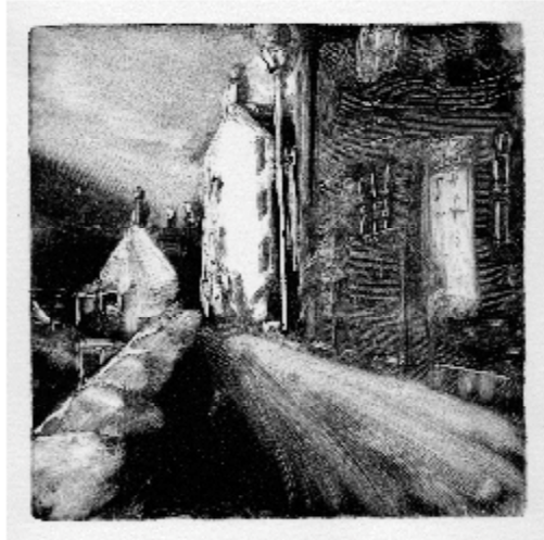
"Staites II" Monotype Print 170mm x 170mm