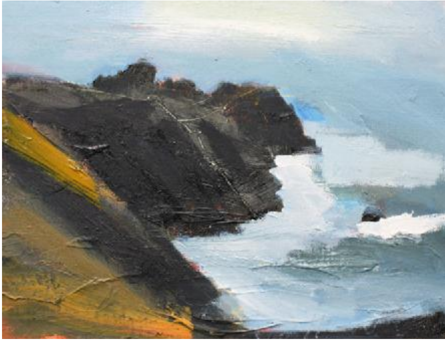
"A Fine Afternoon on St Kilda" Oil on Board 240mm x 180mm