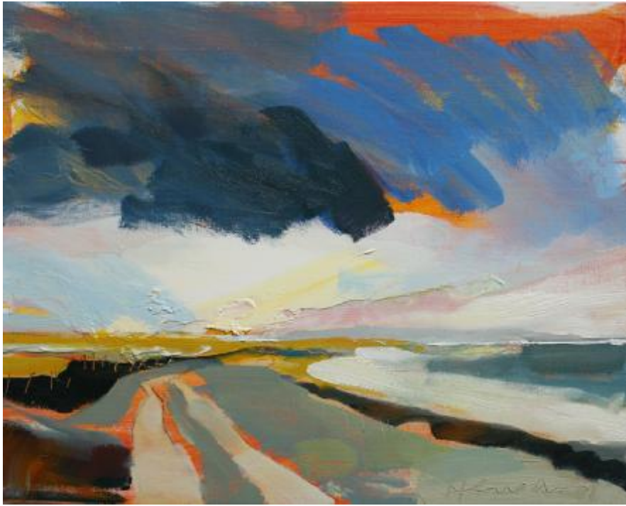
“Towards Eriskay” Oil on Board 300mm x 240mm