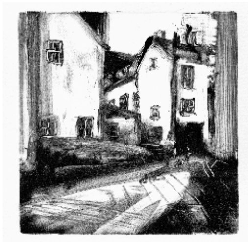
"Staites III" Monotype Print 170mm x 170mm