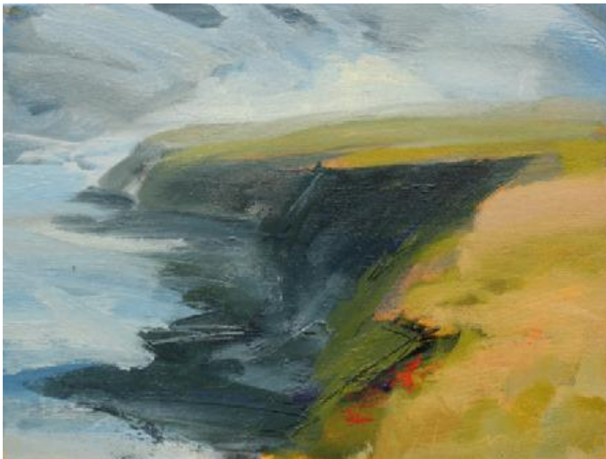
“Cleveland Way 2” Oil on Board 240mm x 180mm