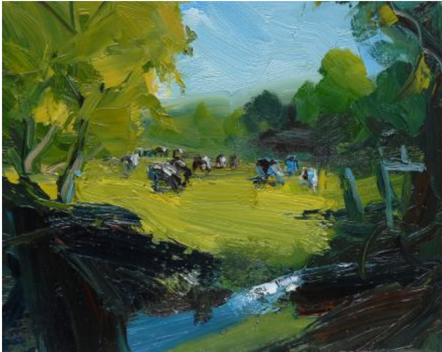
"Water Hole" Oil on Canvas 300mm x 240mm