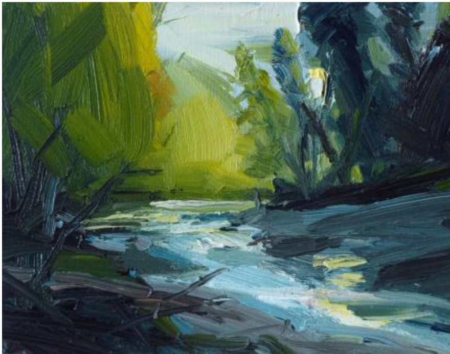
"Flowing Water I" Oil on Canvas 300mm x 240mm