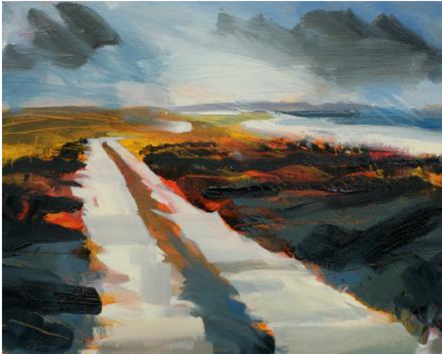
“Potato Patch, Machair” Oil on Board 300mm x 240mm