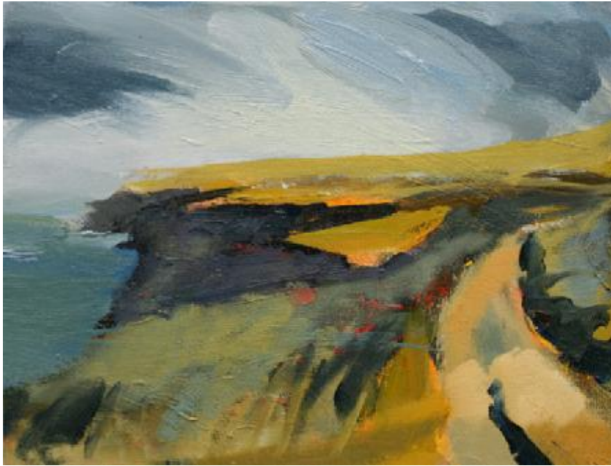
"Cleveland Way" Oil on Board 240mm x 180mm