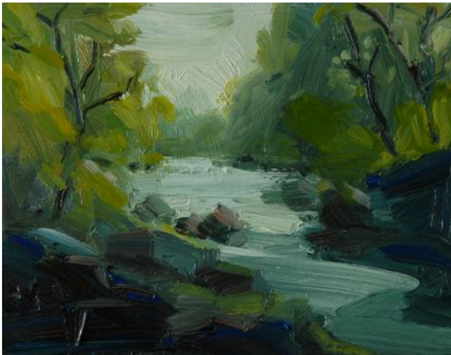
“Flowing Water II” Oil on Canvas 300mm x 240mm