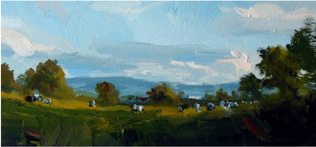
"Evening Light, Late May" Oil on Canvas 400 mm x 170mm