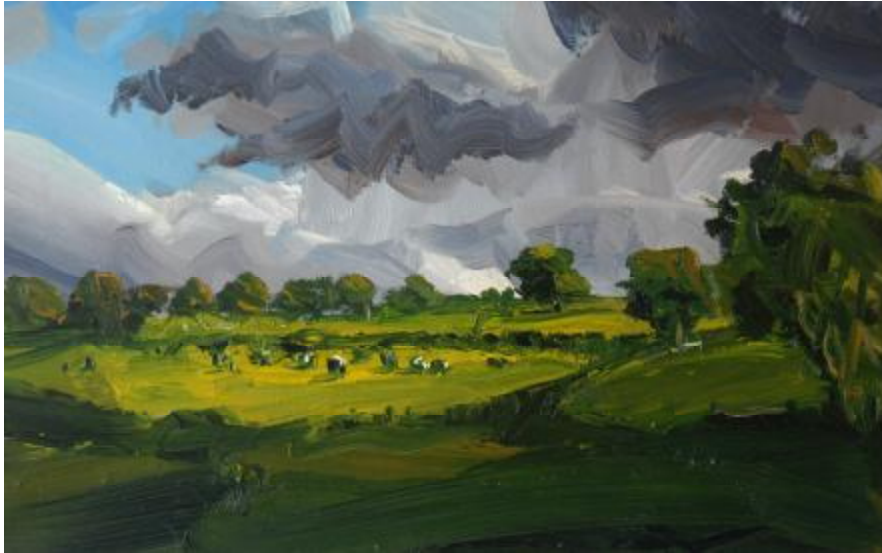
"Dean Moor" Oil on Canvas 450mm x 300mm