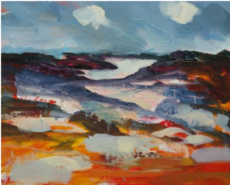
"October Afternoon, South Uist" Oil on Board 300mm x 240mm