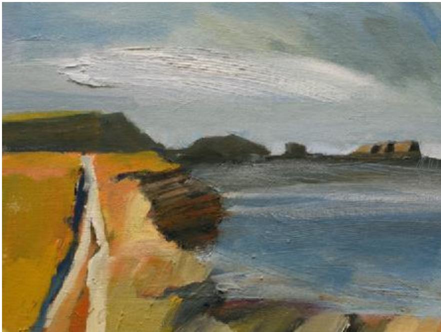
"Late Afternoon Saltwick Nab" Oil on Board 240mm x 180mm