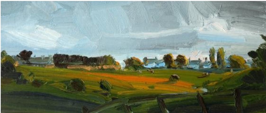
"The Welfare Fields" Oil on Canvas 400mm x 170mm