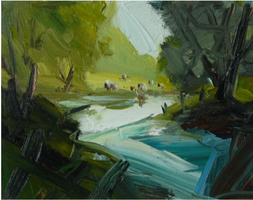
"The Whirlpool" Oil on Canvas 300mm x 240mm