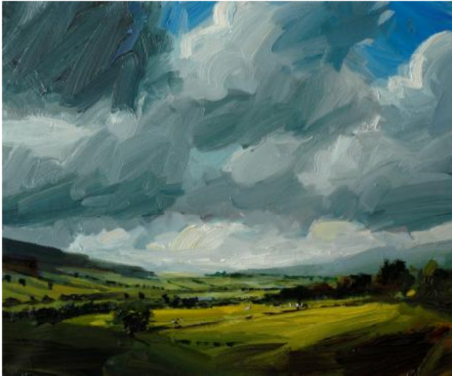
“South Westerly, Kildale” Oil on Canvas 600mm x 500mm