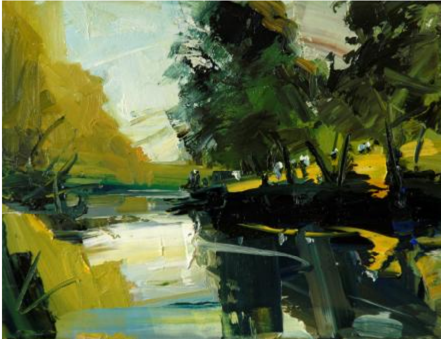
“Reflections, Sandy Hole” Oil on Canvas 450mm x 350mm