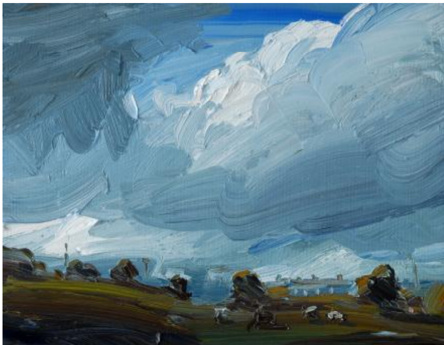
"A Sequence of Events" Oil on Canvas 300mm x 240mm