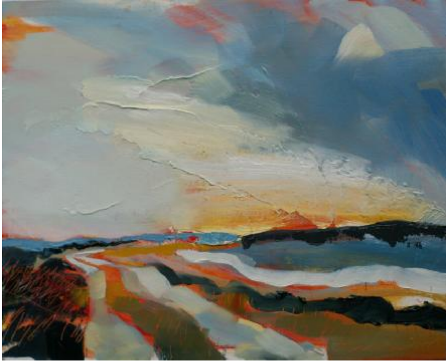
“Sandy Track, Machair” Oil on Board 300mm x 240mm