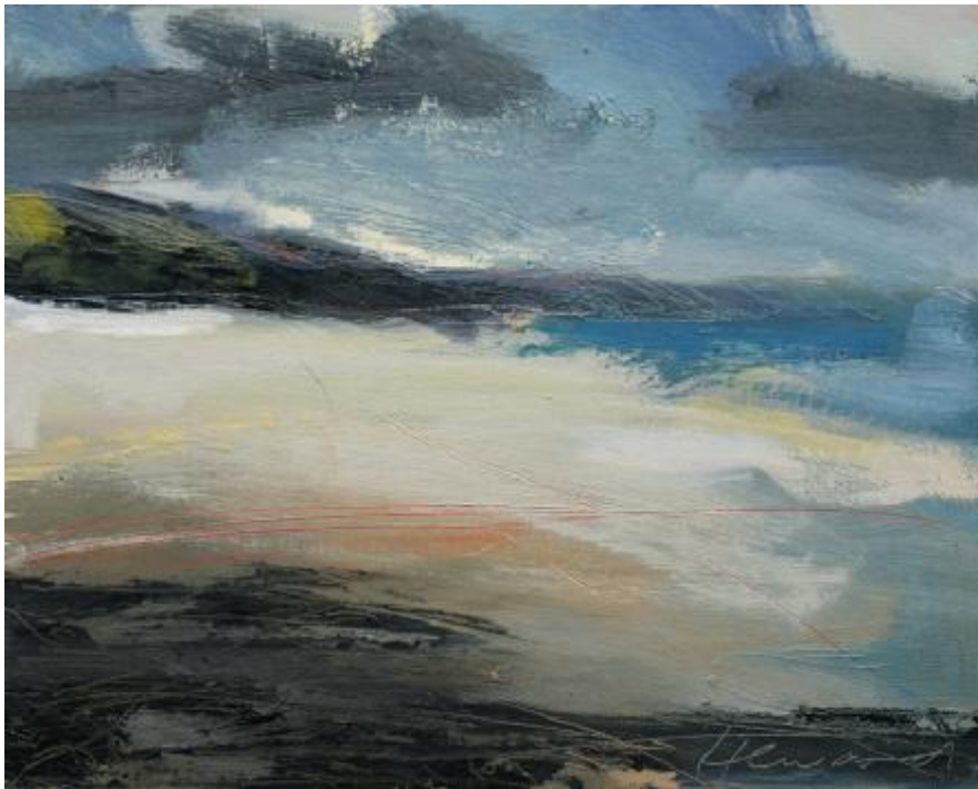
"Rain Clouds on a Stiff Breeze" Oil on Board 300mm x 240mm