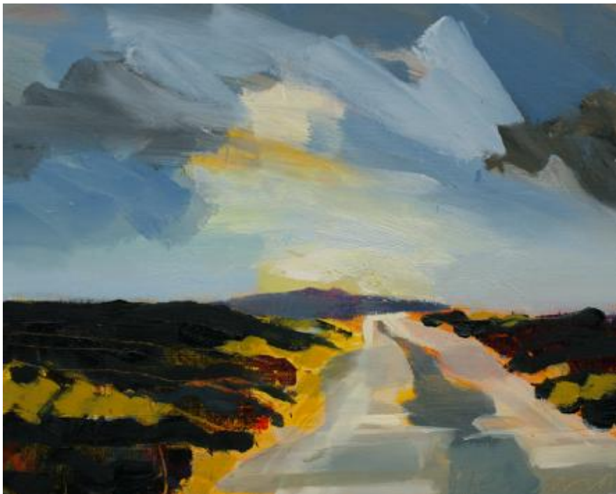
“Late Afternoon Sun, Uist” Oil on Board 300mm x 240mm