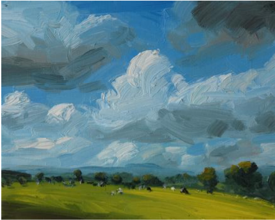
"Spring Sunlight" Oil on Canvas 300mm x 240mm