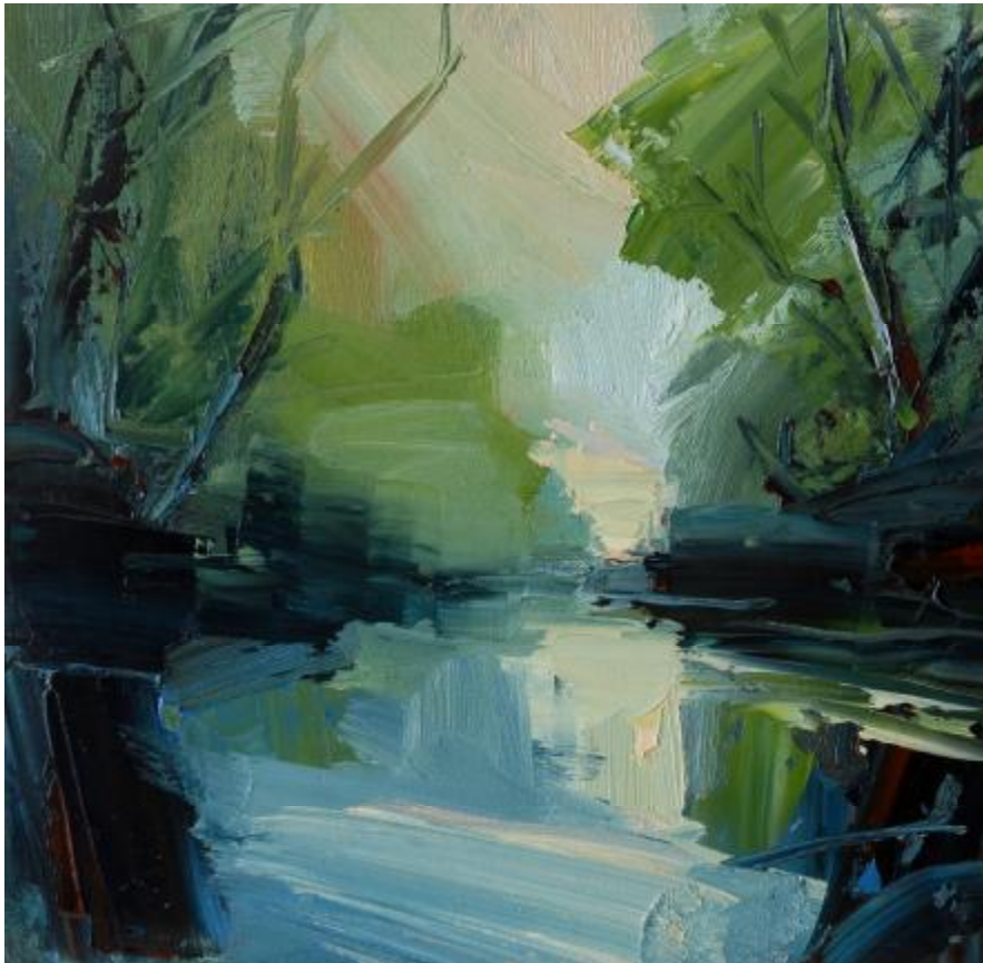
"The Quarry" Oil on Canvas 310mm x 310mm