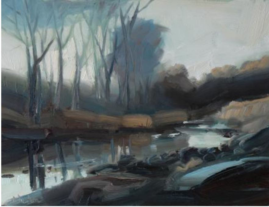
"Winter Light" Oil on Canvas 500mm x 400mm