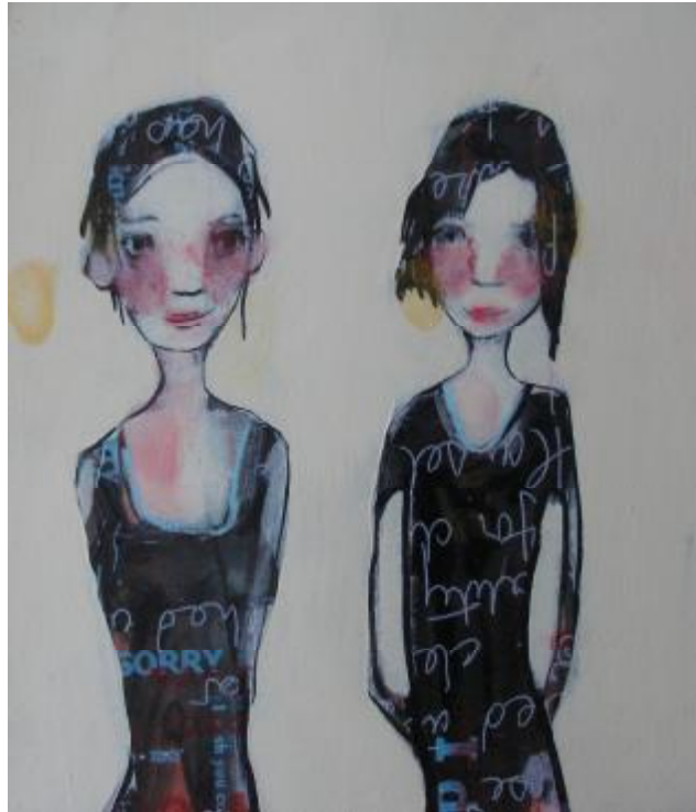
"Snow White, Rose Red" Mixed media 400mm x 380mm