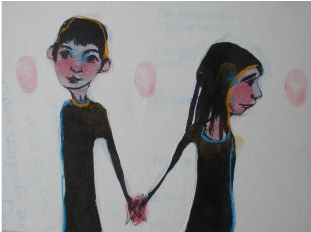
"Into the Woods" Mixed media 370mm x 420mm