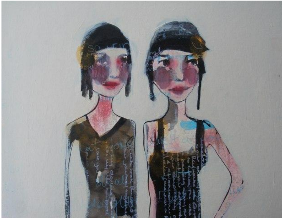
"A Friendship of Sorts" Mixed media 420mm x 450mm