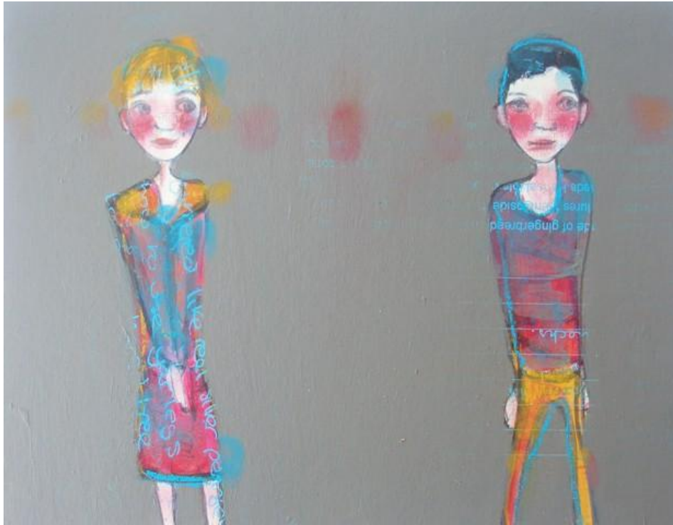
"I didn't mean it" Mixed media 370mm x 420mm