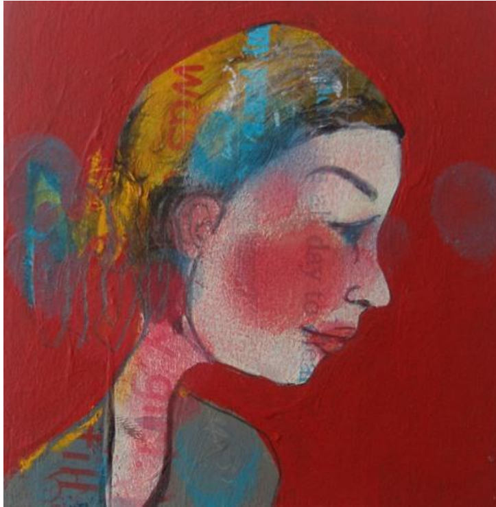
"A Day to Live" Mixed media 280mm x 280mm