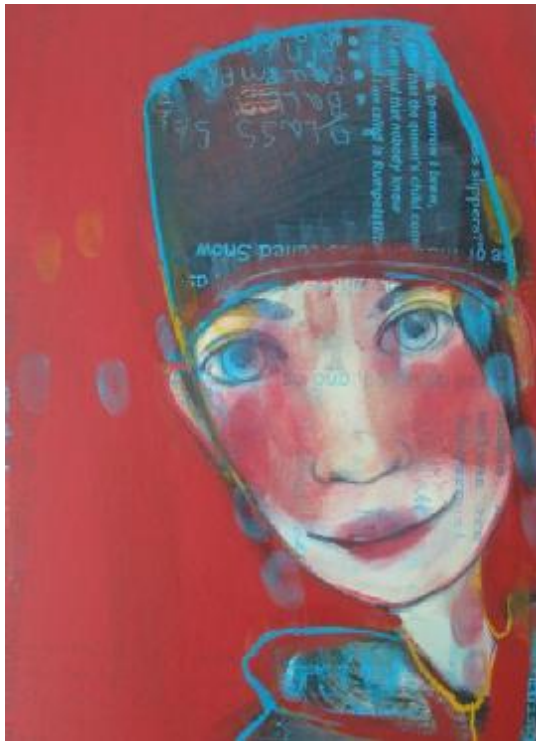
"A Little Man" Mixed media 430mm x 470mm