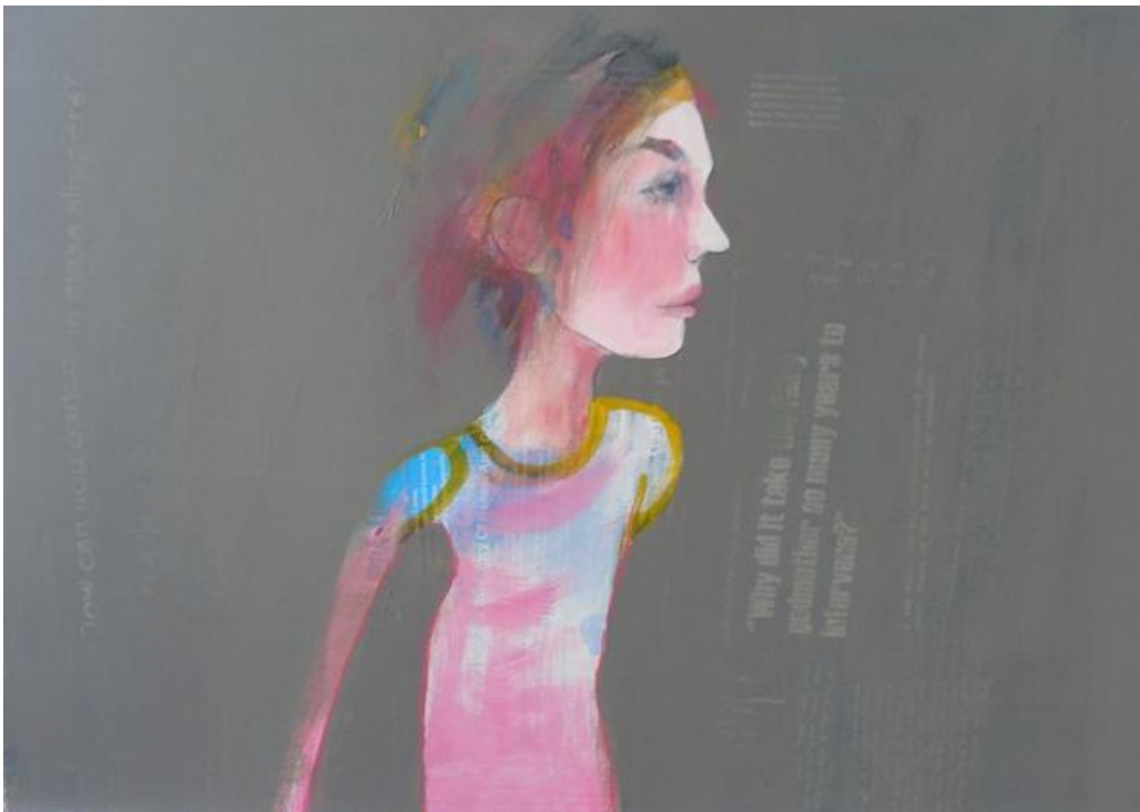
"The Fairy Godmother" Mixed media 620mm x 740mm