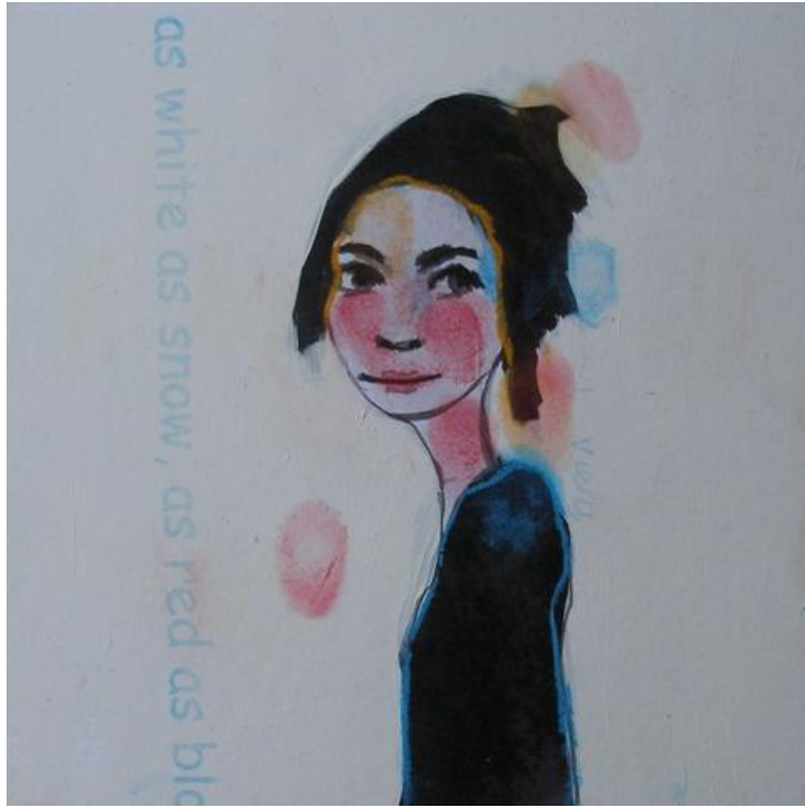
“As White as Snow, as Red as Blood, as Black as Ebony” Mixed media 390mm x 390mm