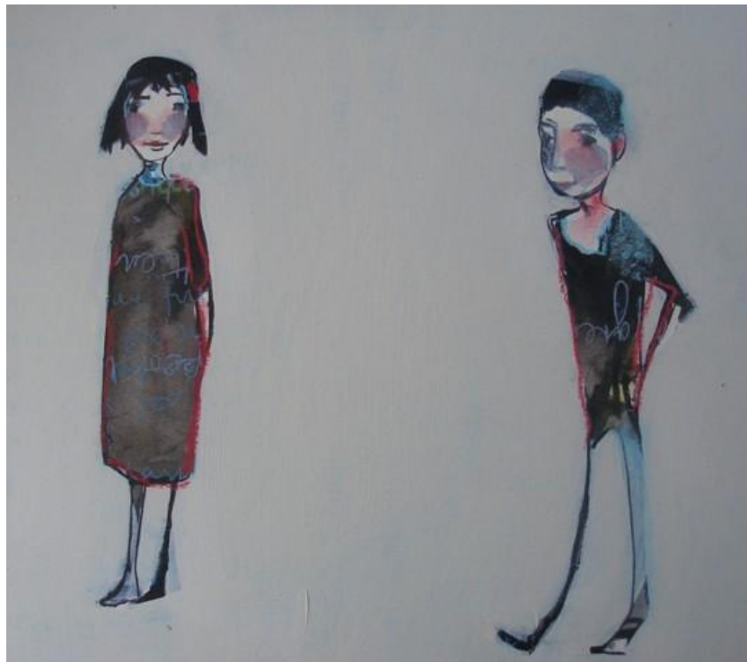
"Two Children" Mixed media 390mm x 410mm