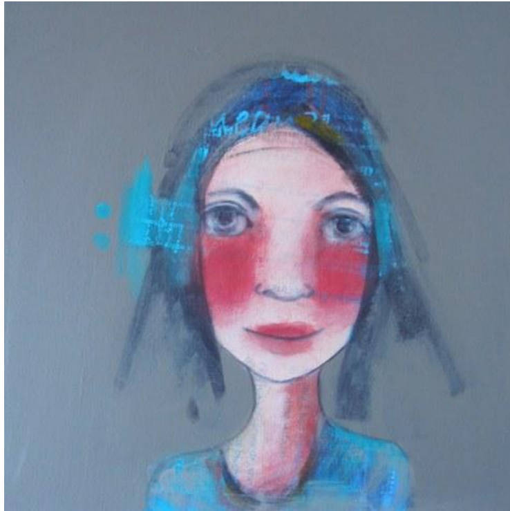
"A True Story" Mixed media on canvas 400mm x 400mm