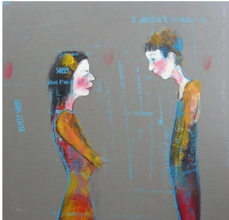
"Sorry" Mixed media 500mm x 500mm