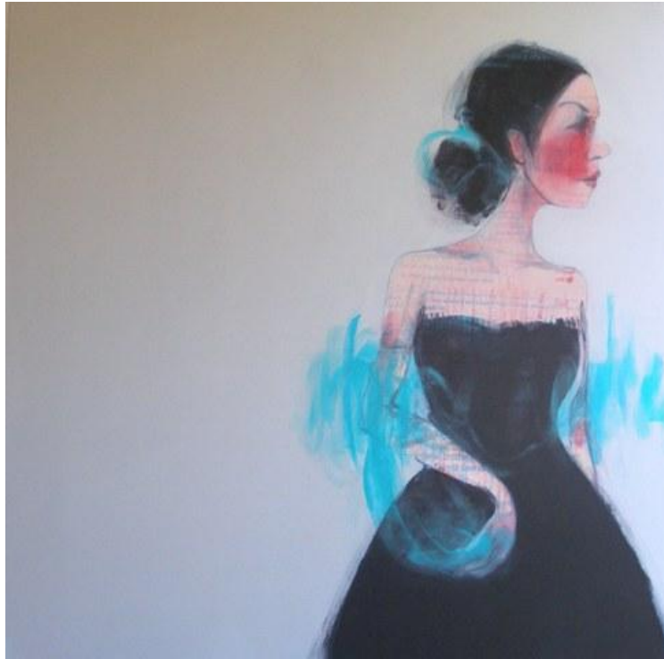
"Return Before Midnight" Mixed media on Canvas 1000mm x 1000mm