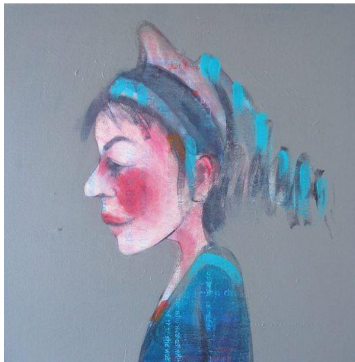
"Mirror Mirror on the Wall" Mixed media on canvas 400mm x 400mm