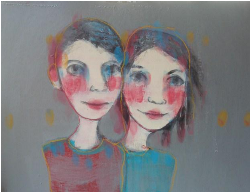
"Brother and Sister" Mixed media 440mm x 500mm