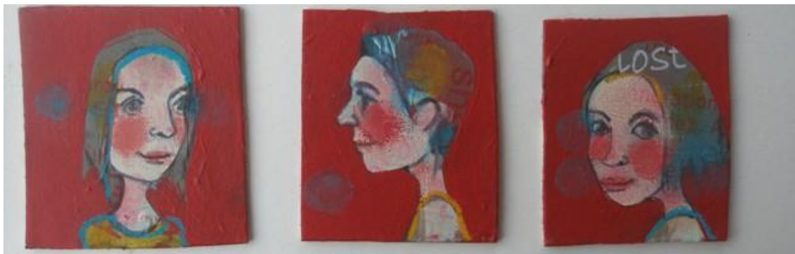
"The Queen's Children" (triptych) Mixed media 280mm x 300mm