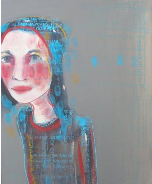
"A Perfect Stranger" Mixed media 620mm x 500mm