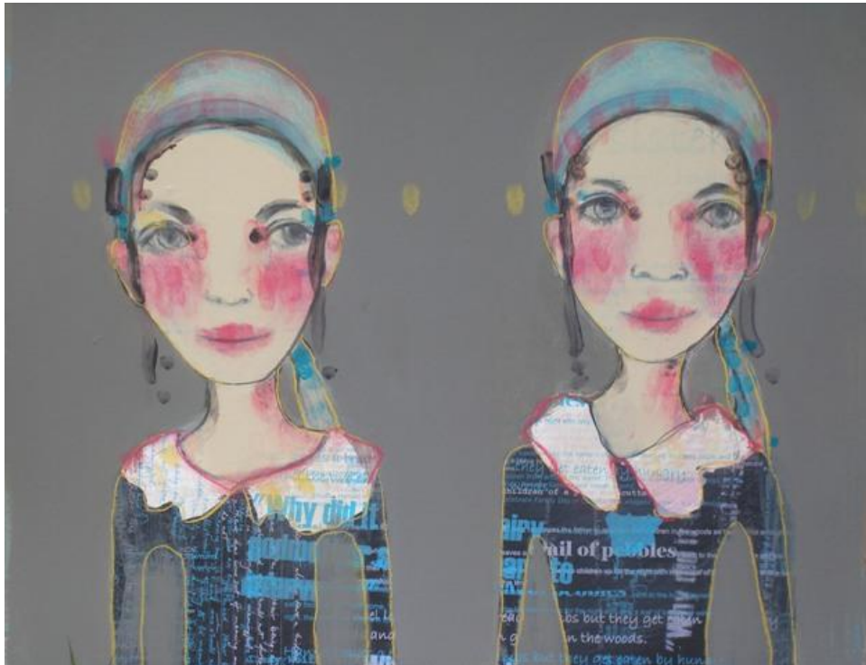
“Two Girls (Spells)” Mixed media 620mm x 660mm