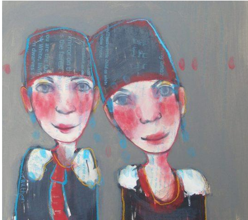
"The Riddle" Mixed media 620mm x 680mm