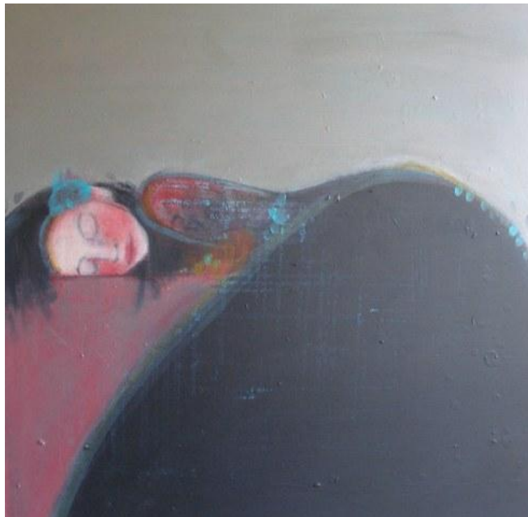
"A Hundred Years Passed" Mixed media on canvas 800mm x 800mm