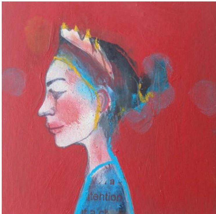
"Rose Red" Mixed media 270mm x 270mm