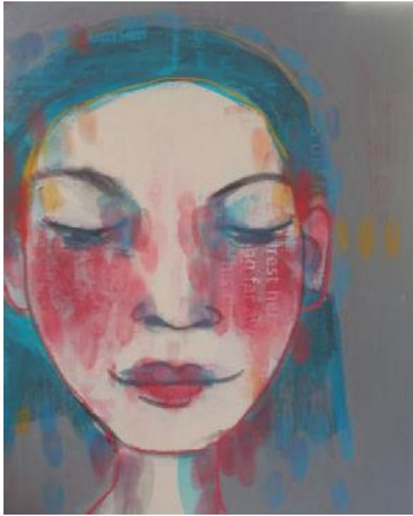
"Far Away this Day" Mixed media 550mm x 490mm