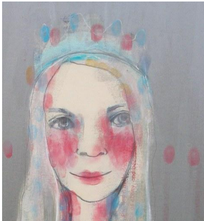
"Rapunzel" (detail) Mixed media 850mm x 620mm