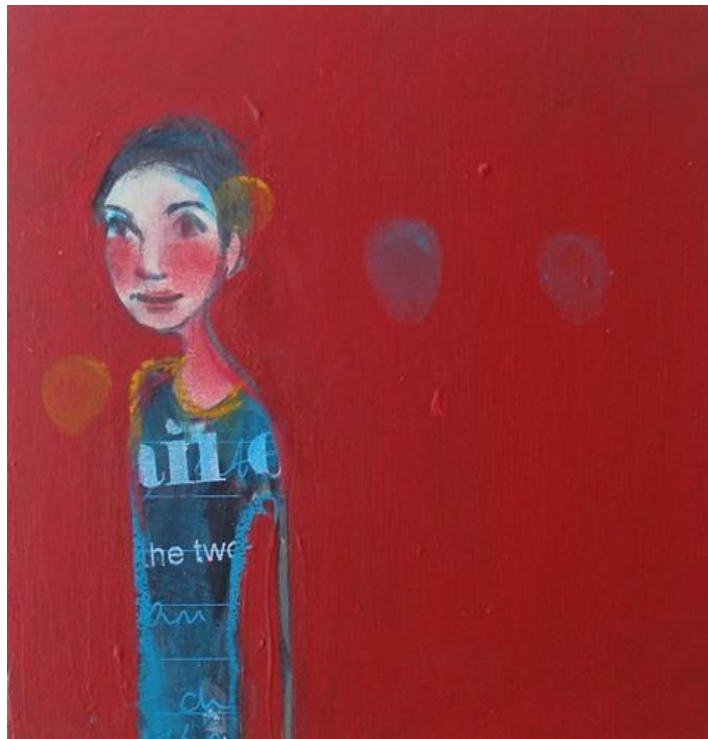
"A Woodcutter" Mixed media 280mm x 290mm