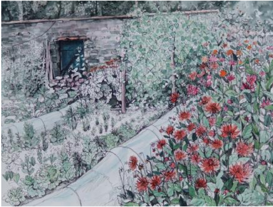
“Dahlias in the Walled Garden” Watercolour, pen and ink 55cm x 70cm