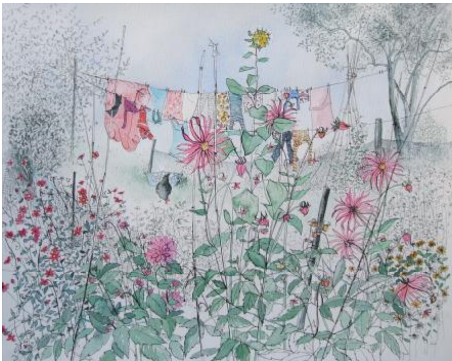
"Washing Line Dahlias" Watercolour, pen and ink 56cm x 67cm