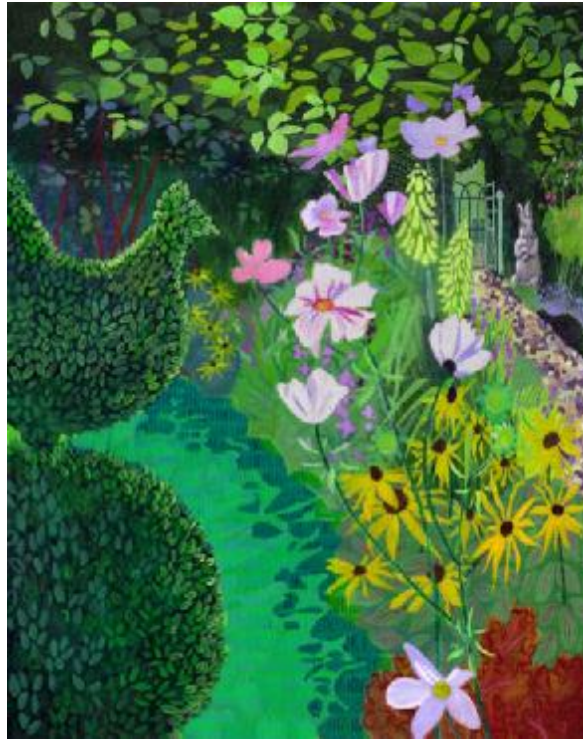
"Garden Creatures" Acrylic on canvas 50cm x 40cm