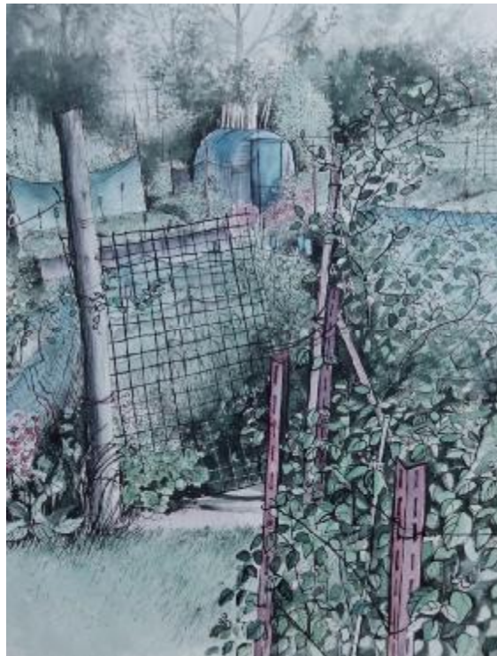
“Sylvia’s Plot” Watercolour, pen and ink 61cm x 53cm