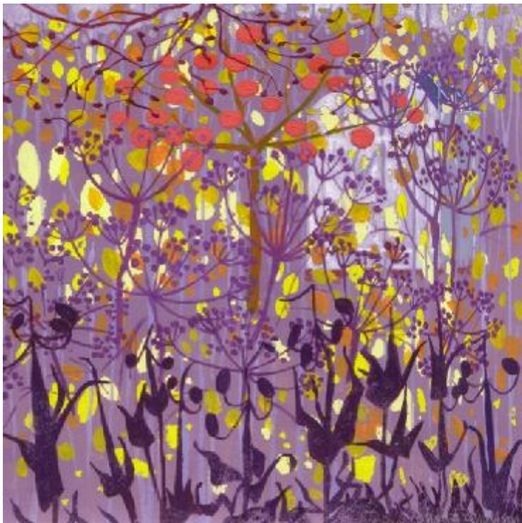
"Autumn Silhouettes" Acrylic on wood 20cm x 20cm