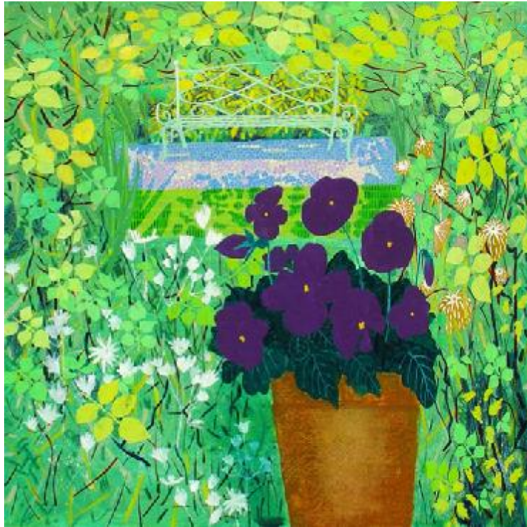
“Autumn - Violas” Acrylic on canvas 60cm x 60cm