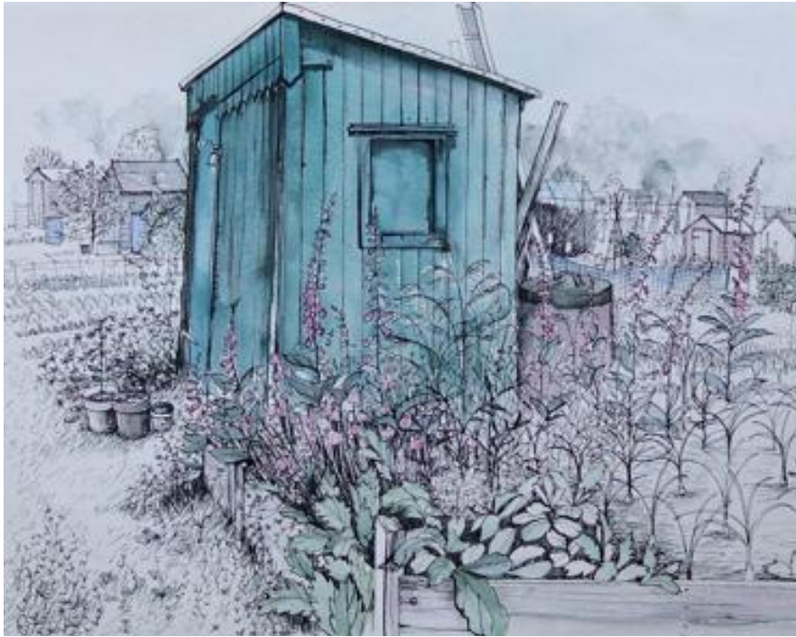
“Foxgloves Hut” Watercolour, pen and ink 48cm x 56cm