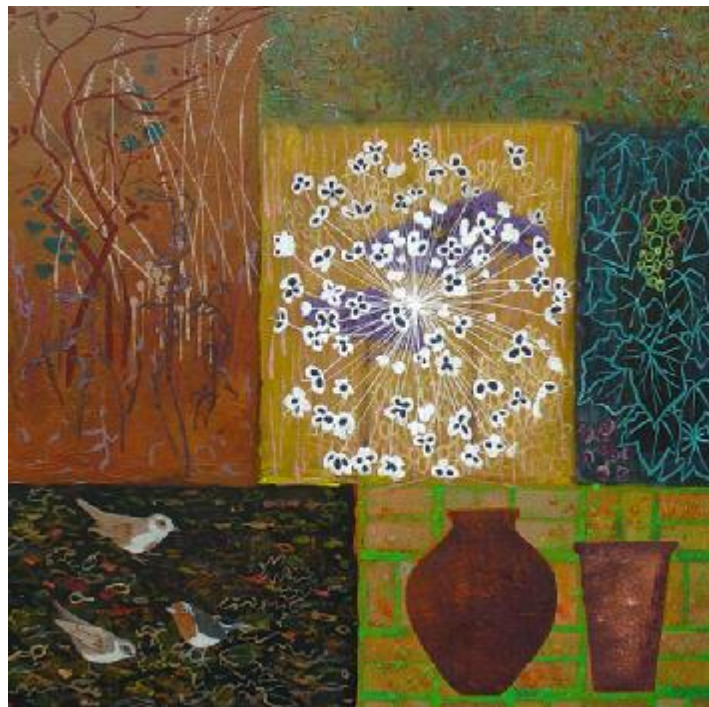
“Winter” Acrylic on canvas 60cm x 60cm