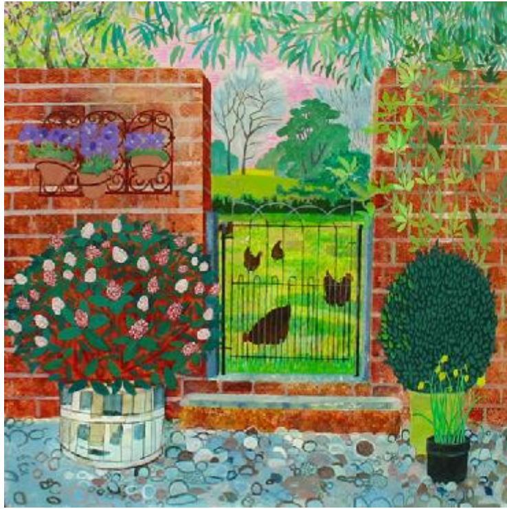
“Gate to the Wood” Acrylic on canvas 60cm x 60cm