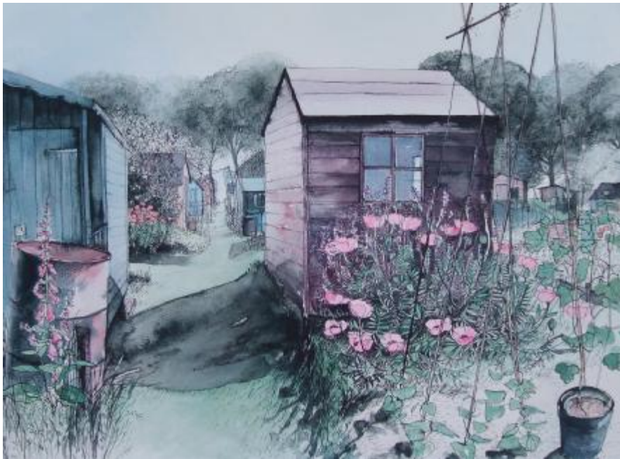
“Allotment Poppies” Watercolour, pen and ink 57cm x 74cm