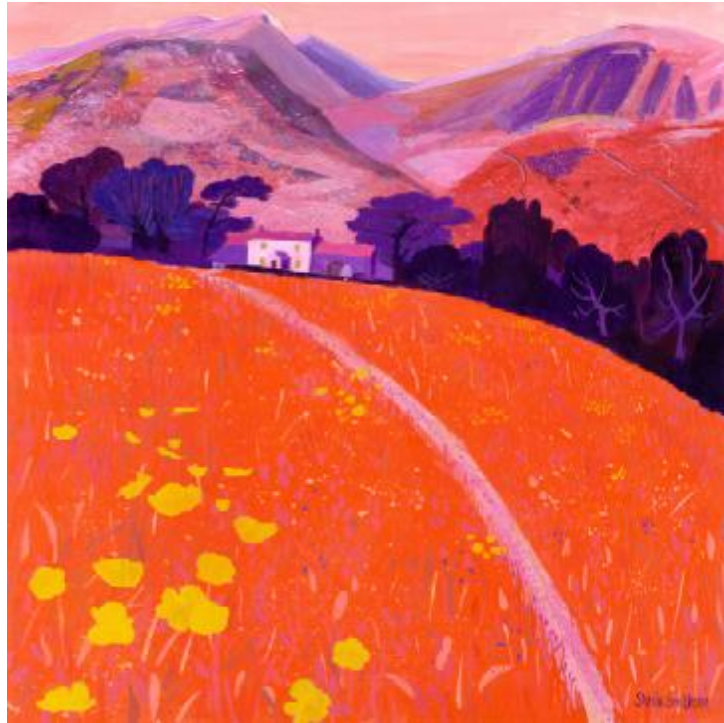
“Evening Borrowdale - Pathway” Acrylic on canvas 40cm x 40cm