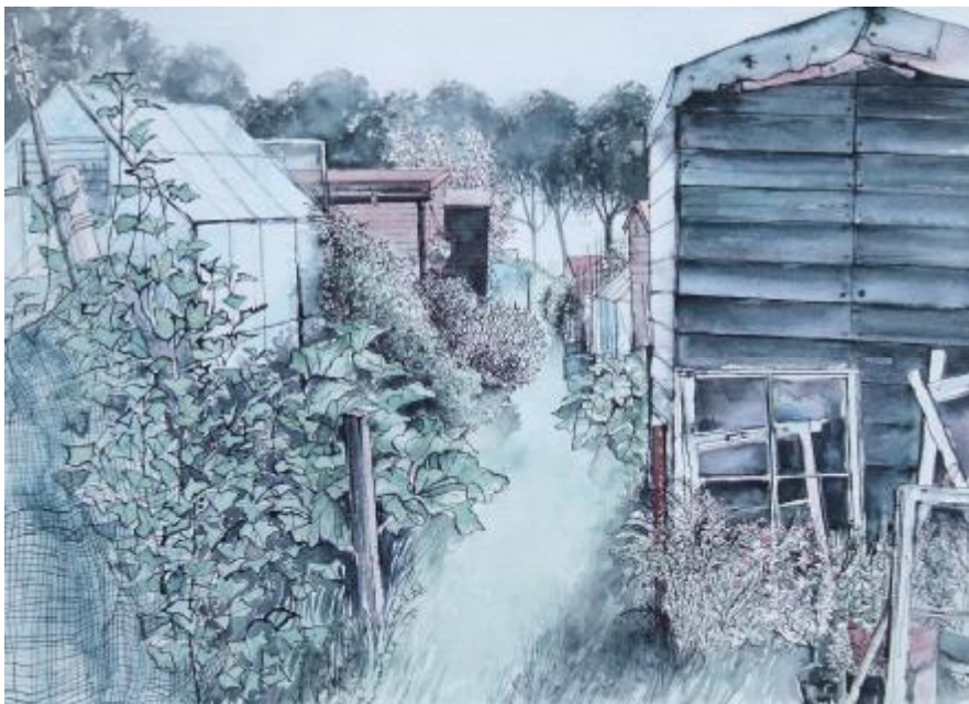
"Early Morning on the Allotment" Watercolour, pen and ink 54cm x 67cm