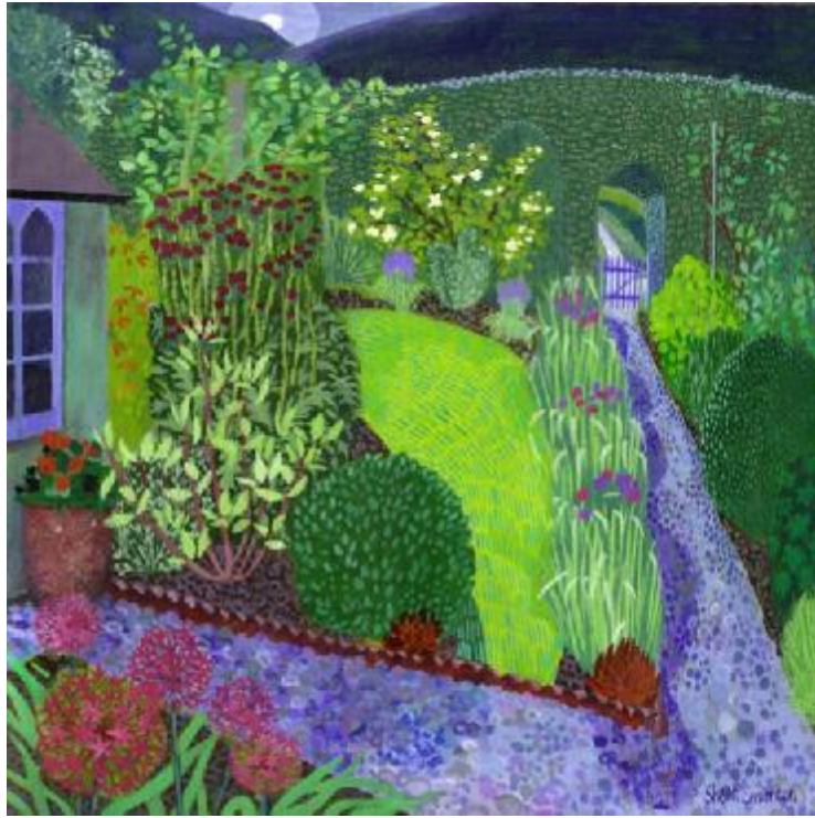
"May Evening" Acrylic on canvas 40cm x 40cm