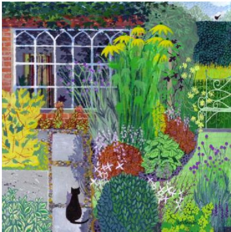
"Summer Window with Cat" Acrylic on canvas 40cm x 40cm