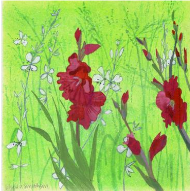
"Gladioli" Acrylic on wood 20cm x 20cm