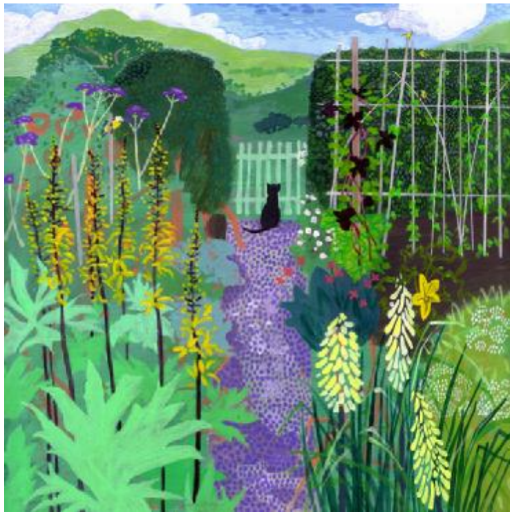
"Stapha at the Gate" Acrylic on wood 30cm x 30cm