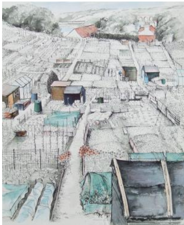
"View of the Lions Allotment II" Watercolour, pen and ink 70cm x 59cm