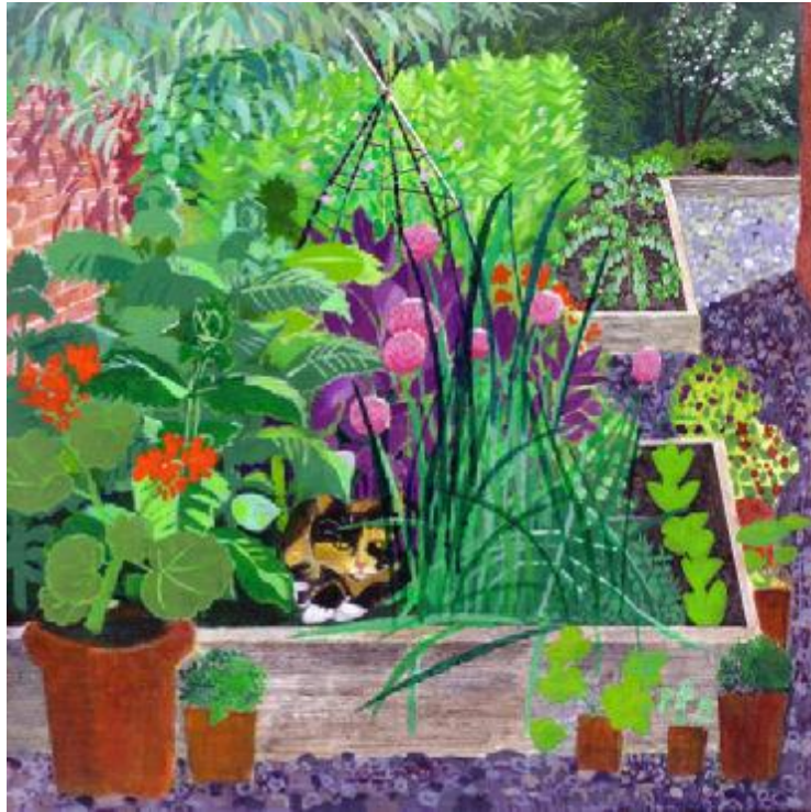
“Cat in the Herbs” Acrylic on canvas 40cm x 40cm