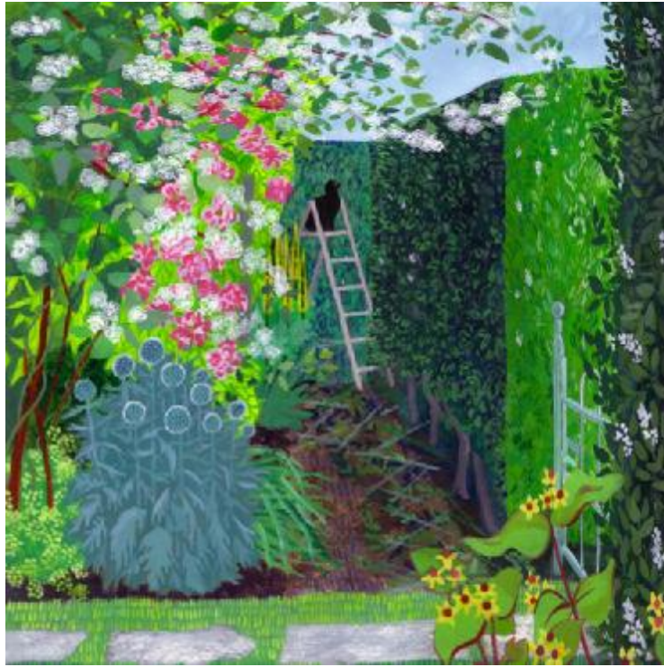
"Cutting the Hedge" Acrylic on wood 30cm x 30cm