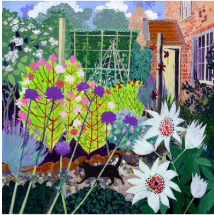
"The Garden Puma" Acrylic on wood 30cm x 30cm