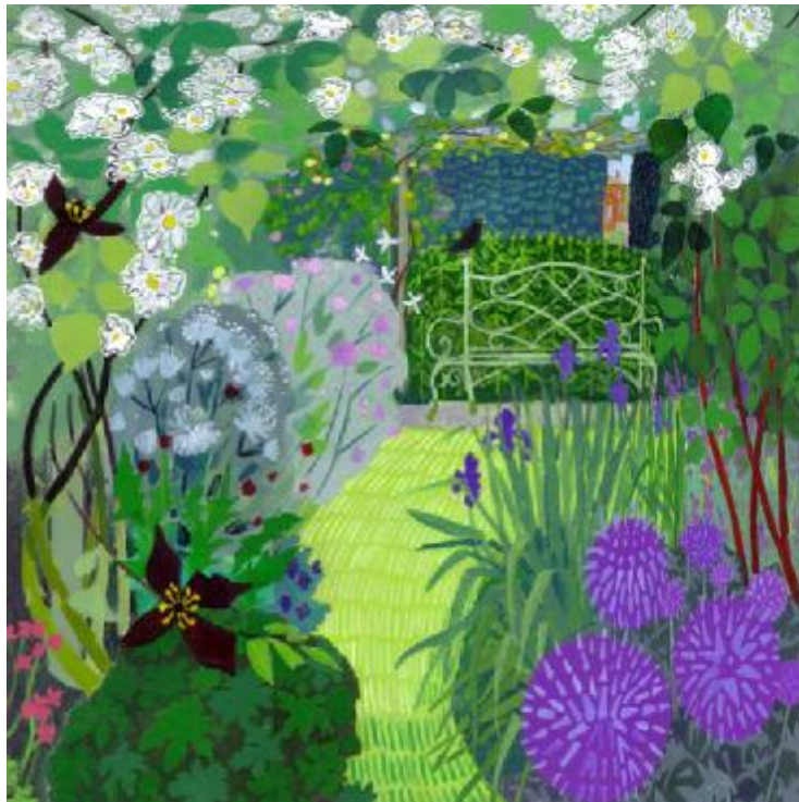
“Blackbird” Acrylic on wood 30cm x 30cm