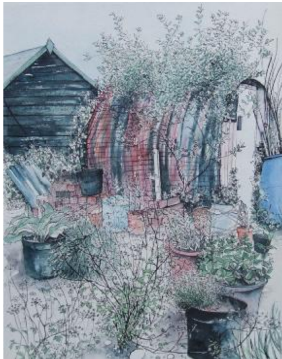
“Huts, Herbs and Honeysuckle” Watercolour, pen and ink 62cm x 52cm