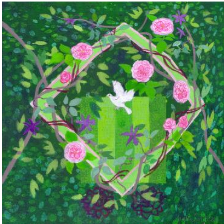
"Summer Garden" Acrylic on wood 20cm x 20cm