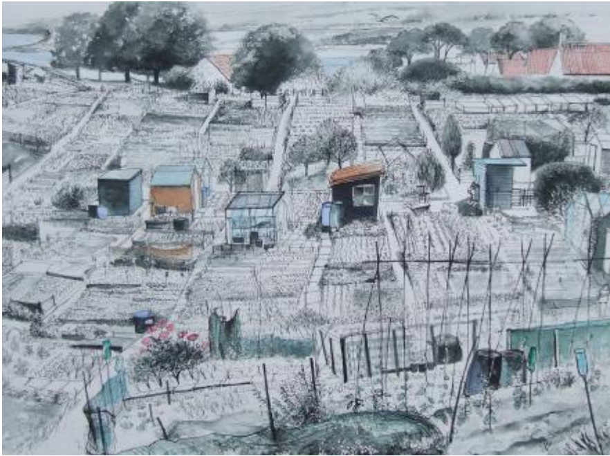
“Overview” Watercolour, pen and ink 56cm x 69cm