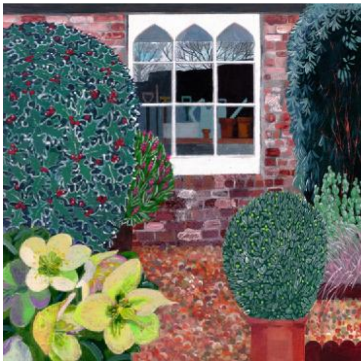
“Potting Shed” Acrylic on canvas 40cm x 40cm