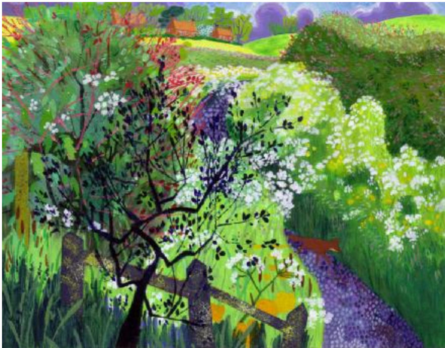
“A Fox Walked Out” Acrylic on canvas 40cm x 50cm