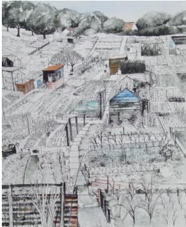
"View of the Lions Allotment I" Watercolour, pen and ink 70cm x 59cm