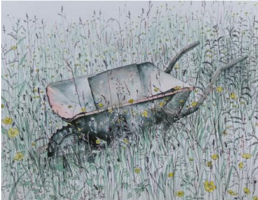
"Wheelbarrow and Buttercups" Watercolour, pen and ink 48cm x 57cm