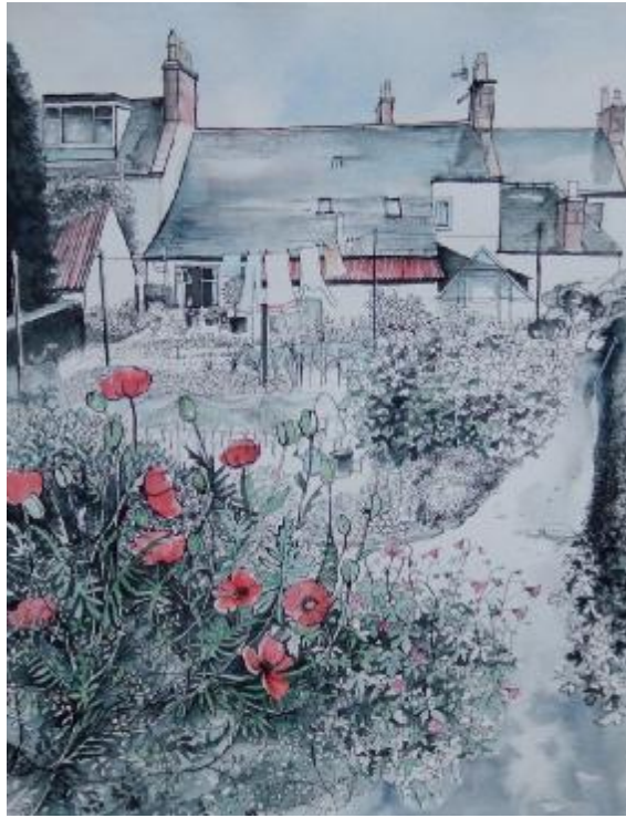
"Mrs Booth's Garden" Watercolour, pen and ink 65cm x 57cm