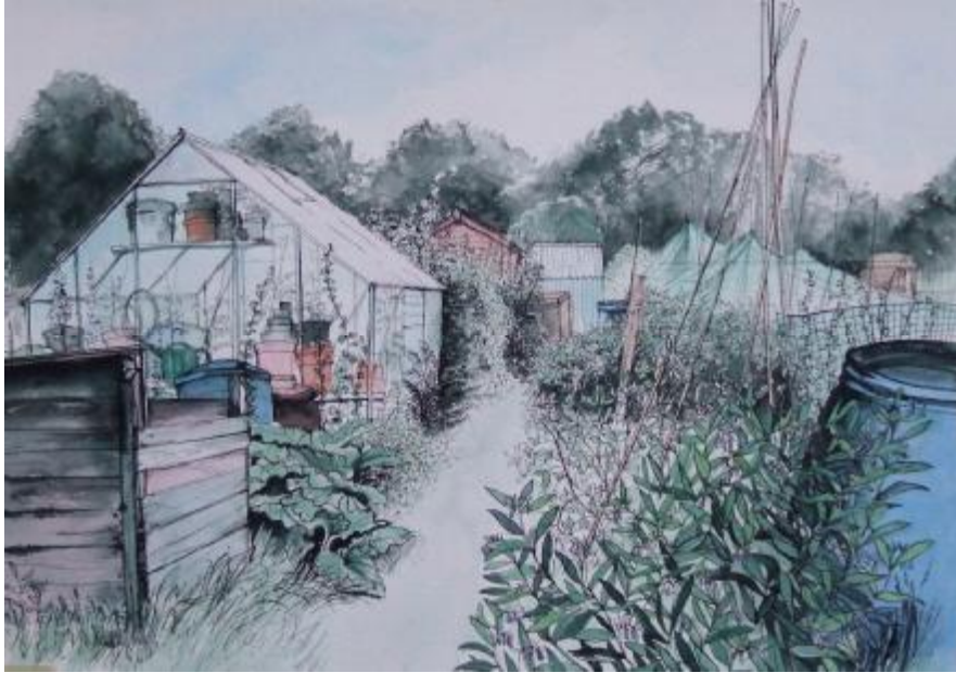
“June Allotment” Watercolour, pen and ink 53cm x 64cm