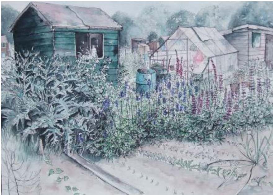
"Flowers on the Allotment" Watercolour, pen and ink 55cm x 67cm